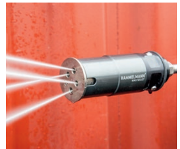
Number of nozzles: 4

Length: 170 mm Diameter: Ø 56 mm Weight 1 kg*