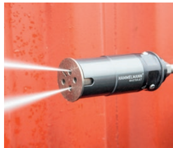
Number of nozzles: 2