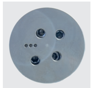
Steel protective cap for wear prevention