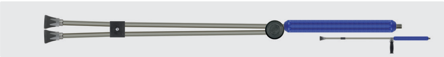
1/4" M. Lance with moulded handle, valve ST-154 aside and nozzle protector ST-10 with low pressure nozzle & thread 1/4" F. Max. 500 bar / 150 °C