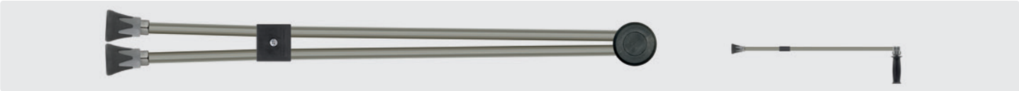
1/4" F. Lance with valve ST-154 aside and nozzle protector ST-10 with low pressure nozzle & thread 1/4" F. Max. 500 bar / 150 °C