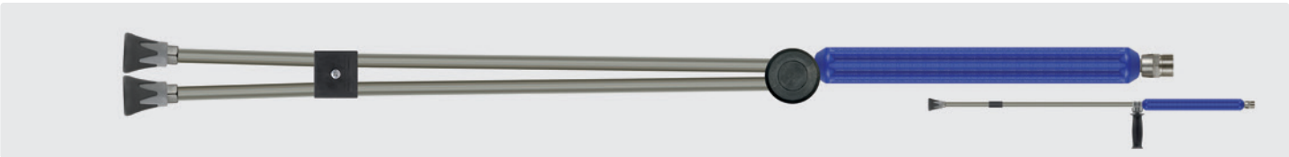
M22 M. Lance with moulded handle, valve ST-154 aside and nozzle protector ST-10 with low pressure nozzle & thread 1/4" F. Max. 500 bar / 150 °C